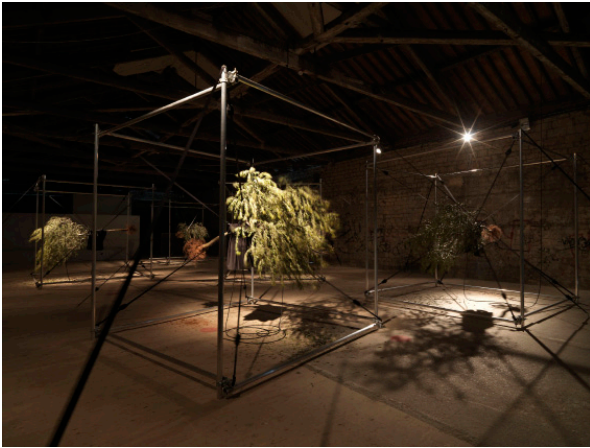
'The Sky Has To Turn Black Before You Can See The Stars' Siobhan Hapasaka Goods Shed, Site Festival 2013