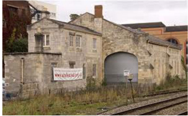
SVA studios designed by Tony Fretton Architects Brunel Goods Shed