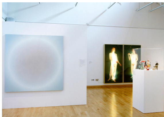
Site 09 Darbyshire selected exhibition, Museum in The Park June 2009