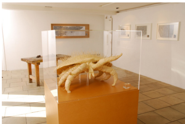
'Bee Lines' Alice Forward , Site 09 Darbyshire Award winner SVA, February 2010